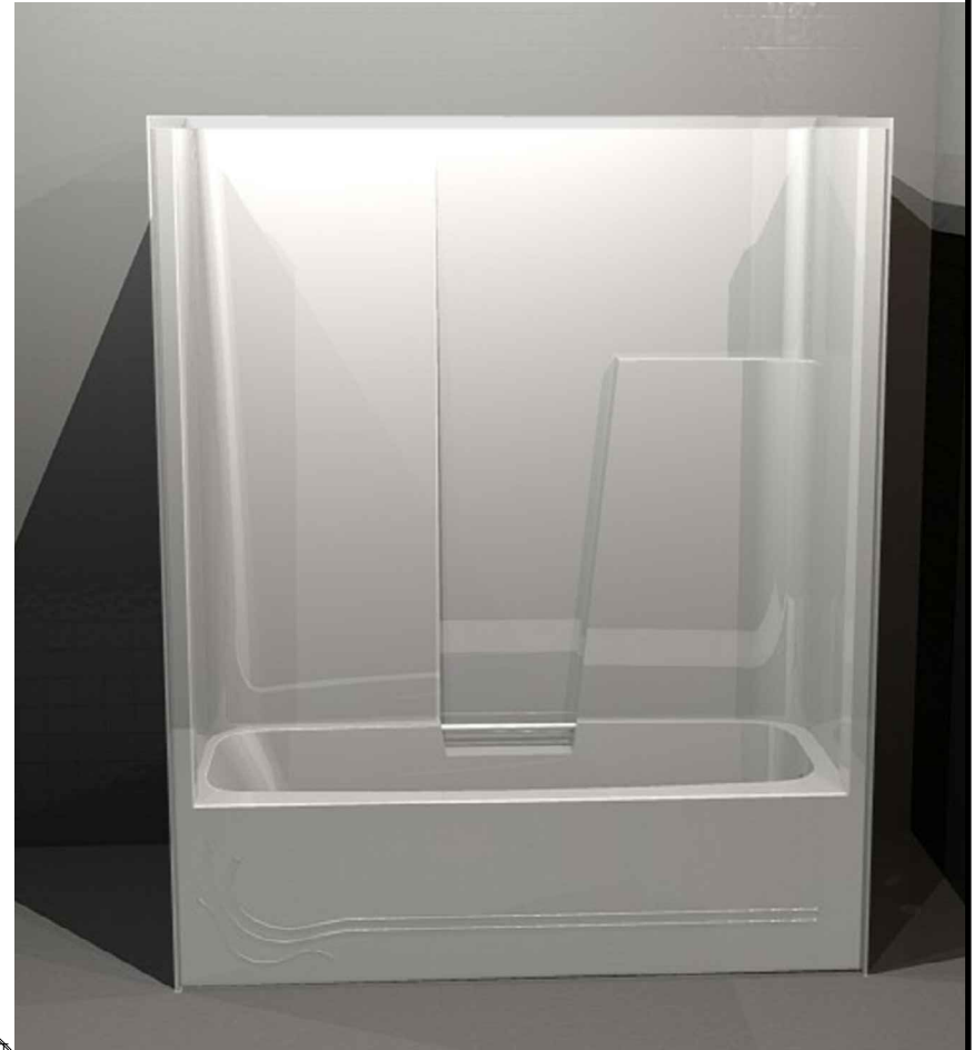
RIGHT END VIEW scale: 1/2" = 1"